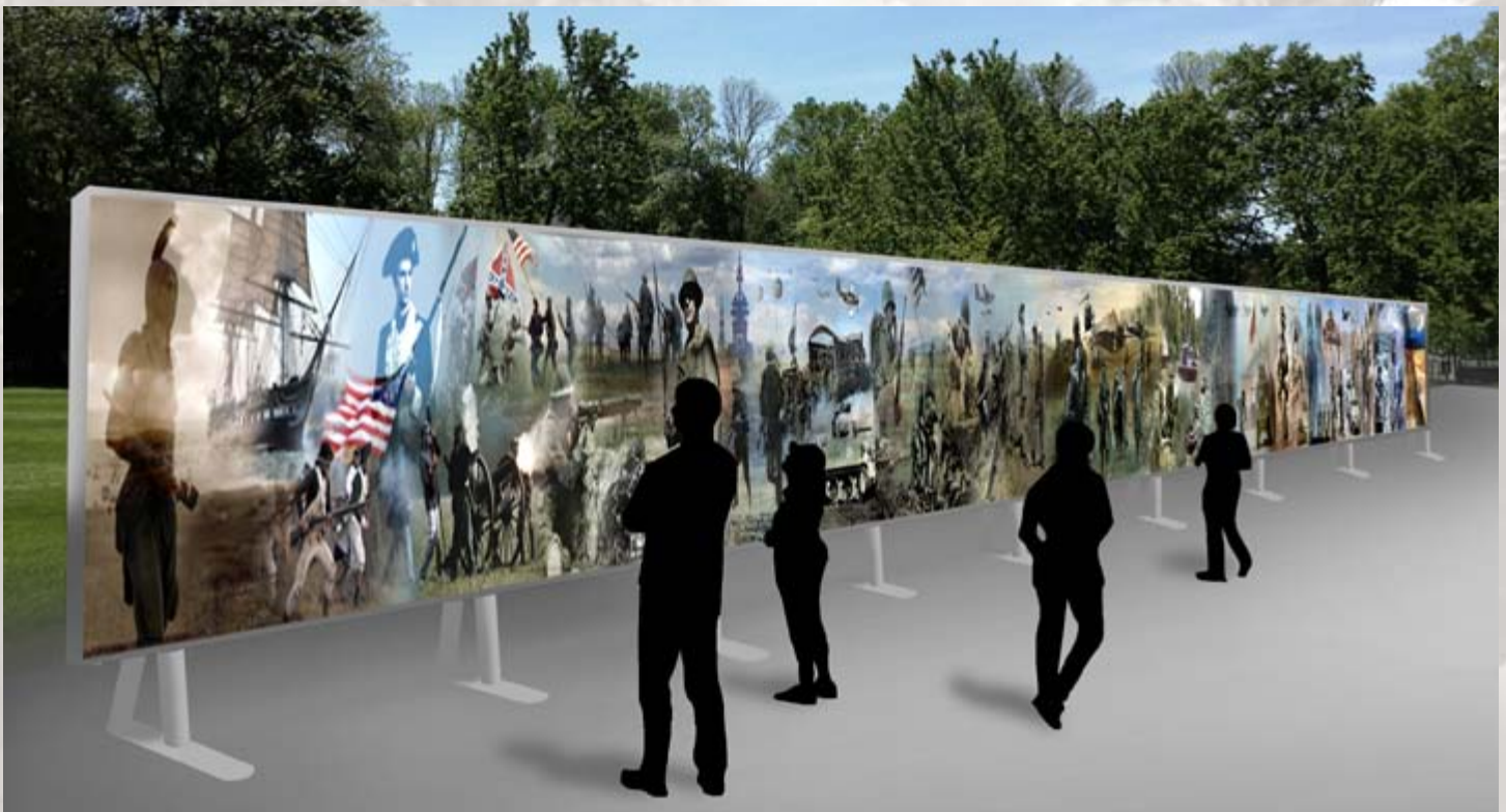
An artist's rendering of how the wall may appear outdoors.

You may also want to visit us on Facebook.